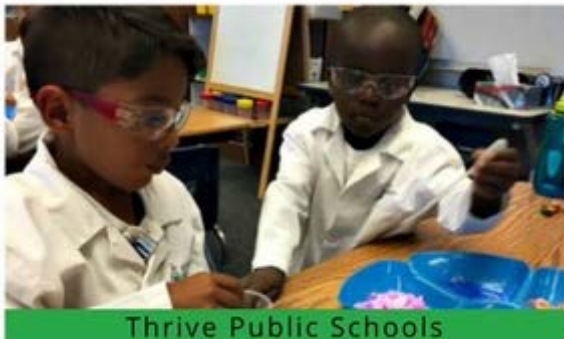
Thrive Public Schools

After a year of planning and working with investors and prospective borrowers, we are thrilled to announce our first impact-based loans to advance economic opportunity.